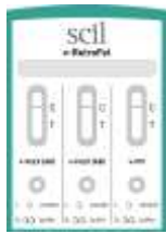
test cassette (6/ 18)